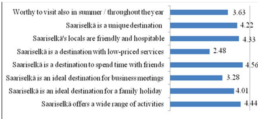
Fig. 3. Opinions on Saariselkä

One can see that tourists perceived Saariselkä as a destination offering a wide variety of activities, which can be performed along with a group of friends (see fig. 3). A large portion of the respondents considered the locals to be hospitable and friendly, and Saariselkä to be a unique/original destination. The average score for the first statement had the value of 3.63 (where: 1-don't agree, 5-agree), meaning that tourists agreed that the destination is worth being visited also in the summer season/throughout the year.