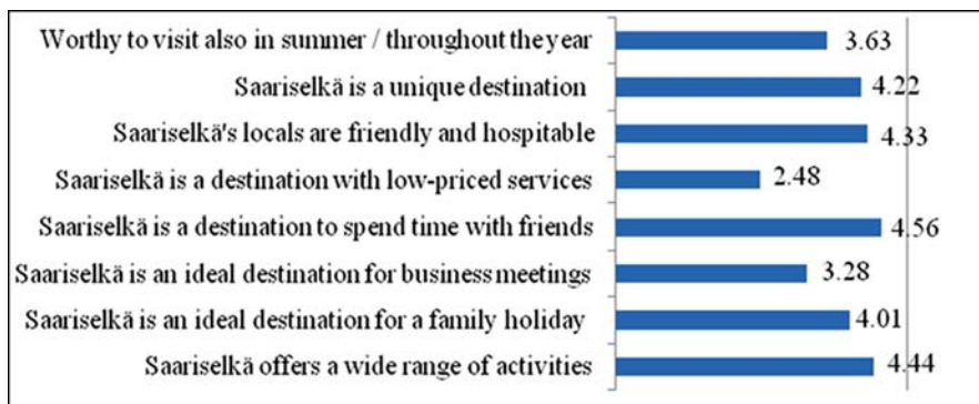
Fig. 2. The importance of various factors when choosing Saariselkä

As for the most important factors for choosing Saariselkä, results showed that nature and a relaxing environment played a major role (see fig. 2). This factor had an average of 4.71 in terms of importance (where: 1-very unimportant, 5-very important). 76.5% of respondents considered that nature and a relaxing environment were very important in the decisional process of choosing Saariselkä as their holiday destination. Most respondents totally agreed that Saariselkä is an ideal location for spending the holidays with a group of friends, yet they did not agree that, in this destination, the price of services is low.