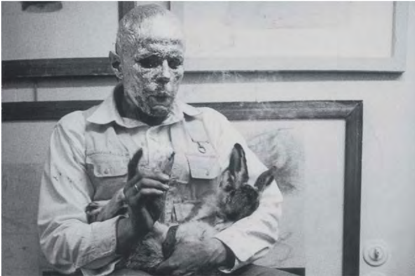
Fig. 6. Beuys's celebrated performance How to Explain Pictures to a Dead Hare , 1965

...It has been necessary to move from iconoclasm to what I have called iconoclasm —namely, the suspension of the critical impulse, the transformation of debunking from a resource (the main resource of intellectual life in the last century, it would seem), to a topic to be carefully studied. While critics still believe that there is too much belief and too many things standing in the way of reality, compositionists believe that there are enough ruins and that everything has to be reassembled piece by piece" (Latour 2010).