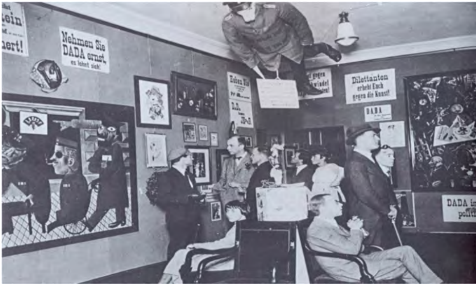
Fig. 3. Reference image for Ghenie's Dada Is Dead : the First International Dada Fair, Berlin, 1920

image of the dog that haunts the celebrated, now devastated Dada room are key elements of Ghenie's apocalyptic view upon Dada. In fact, it is exactly through such an apocalyptic reinterpretation of Dada that Adrian Ghenie dwells on the movement's destructive allegations, on its aesthetic nihilism.