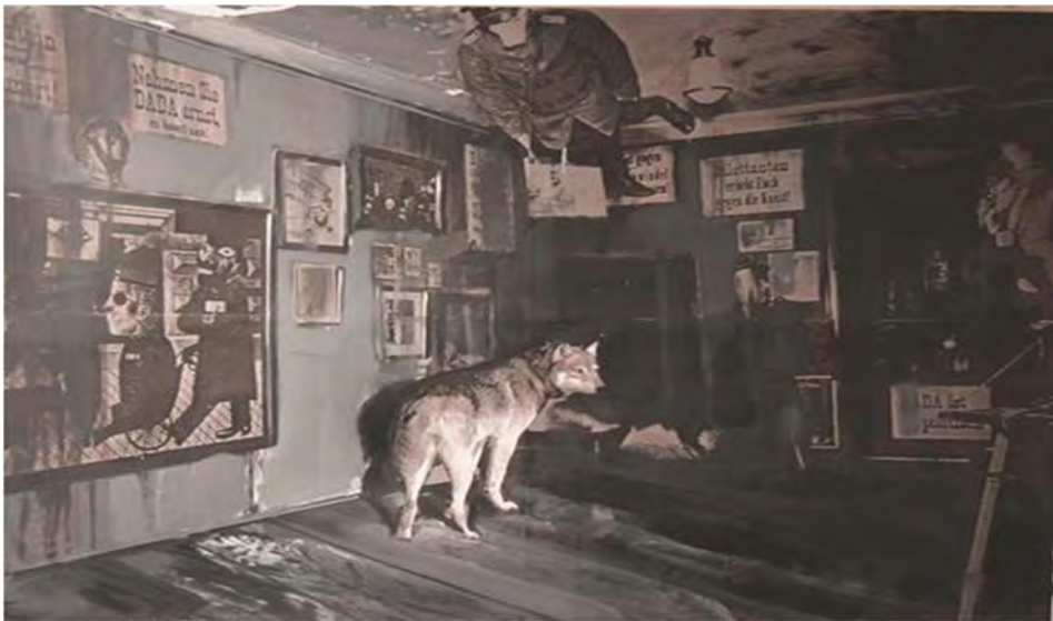
Fig. 2. Adrian Ghenie, Dada Is Dead , 2009

His painting Dada Is Dead (2009) comes as yet another powerful statement of artistic ideology, reinforcing the codependency of art history and political history. The reference is the famous photograph of the First International Dada Fair held in Berlin in 1920, having as a key metaphor the image of John Heartfield's assemblage Prussian Archangel , a pig-headed military mannequin strangely suspended from the ceiling. As Stefanie Gommel states, in Dada Is Dead Ghenie "recalls Hitler's headquarters in East Prussia, also known as Wolfsschanze, and thus revives awareness of the fates of the 'degenerate,' ostracized artist." (Gommel 2013).