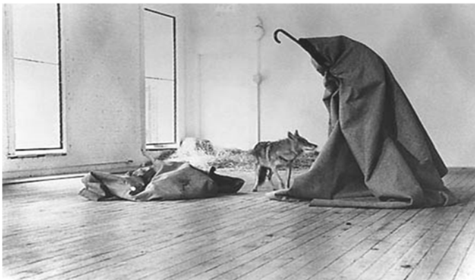
Fig. 7. Joseph Beuys, Coyote: I Like America and America Likes Me , 1974

In Mircea Cantor’s film installation Deeparture (2005), the live protagonists are a wolf, behaving in a strangely peaceful manner within the white cube of the stage, and his most unexpected stage partner, the ingénue character “played” by a deer. The tender irony included in the “moral fable” of Cantor’s video work invokes another mythologized figure, the Fluxus or Neo-Dada artist and art pedagogue Joseph Beuys, with his totemic performance Coyote (1974).