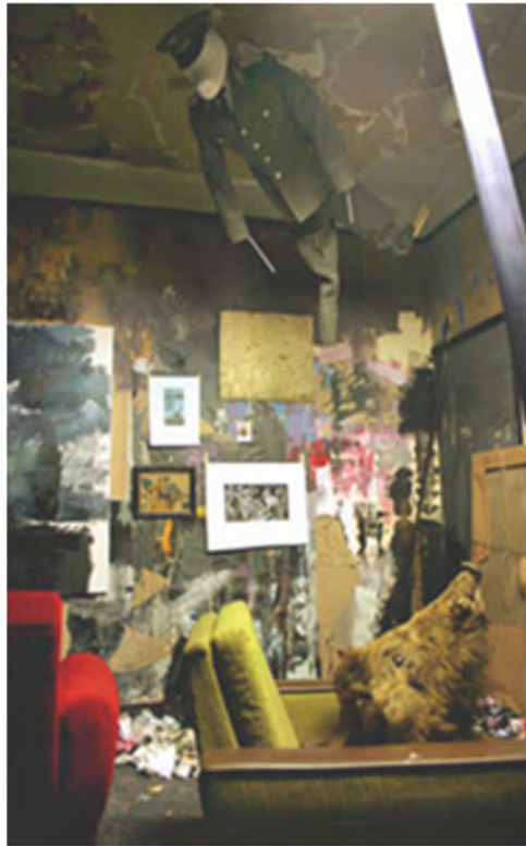
Fig. 4. Adrian Ghenie, The Dada Room , 2010

The immersive installation The Dada Room (2010) takes on a similar disruptive perspective on the cultural myth of Dada, pointing to its successive artistic “deaths” and rebirths. This intriguing invention of a pseudo-archive of Dadaist sites and objects seems to be meant to stir aesthetic controversy over the longevity or the obsolete character of Dadaism. There is a silent yet vivid dialogue between the medium of painting – here, one should notice the large amounts of paint spread over the walls and the floor – and the objects of the installation which restage once again the First International Dada Fair from Berlin (1920).