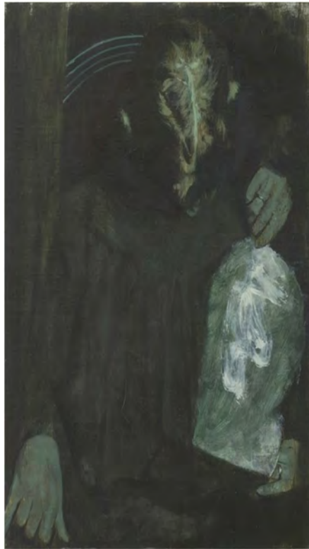
Fig. 5. Victor Man, Untitled (from The White Shadow of His Talent) , 2011

In spite of his polemical and sometimes distanced relation to historical avant-garde, in The Dada Room Ghenie is actually performing, in the purest avant-garde spirit, a certain type of art documentation on Dadaism which becomes yet another form of life, or, more accurately, a hybrid space situated beyond the threshold between art and life. Art theorist Boris Groys can be rightly invoked in this context, as for him art documentation should be considered the process in which “art becomes a life form, whereas the artwork becomes non-art, a mere documentation of this life form” (Groys 2008, 53). The liveness of this performative art documentation, one that situates itself beyond a mere aesthetic relevance and is pervaded by a strong anthropological content, is to be found with other representatives of the “Cluj School”, among which are Victor Man and Mircea Cantor. In the mysterious Shamanic-like posture of the silhouette in his Untitled (from The White Shadow of His Talent) , 2011, Victor Man seems to recall the aura of Joseph Beuys’s actions.