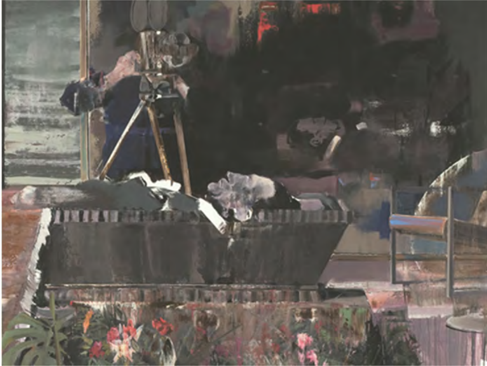
Fig. 1. Adrian Ghenie, Duchamp's Funeral I , 2009

Oil and acrylic on canvas, 200 x 300 cm. Private Collection, Switzerland