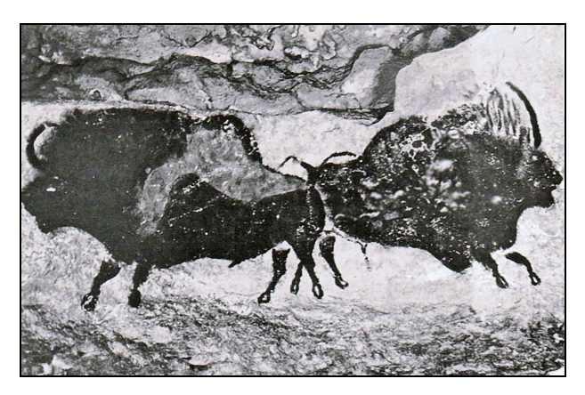
Fig. 1. Two bison in cave at Lascaux, Dordogne, France.

It should be said at the beginning that research into the affects of sound and the design of aural architecture is in its infancy. As a result, the basis of my argument is informed by material gathered from a cross-disciplinary investigation into art, art history, sociology, neurology, phenomenology and technology;<sup>6</sup> and the points I am attempting to discuss and argue for are primary, mostly untested thoughts, and by no means manifest. Yet, I am hoping to assemble the knowledge logically and coherently, so to throw clear evidence onto the qualities and the growing importance of sound for built design and its occupants.