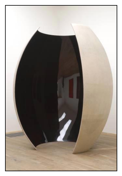
Fig. 4. Anish Kapoor, Ishi's Light , 2003, fibreglass, resin and lacquer, 3150 x 2500 x 2240 mm sculpture

the same people also determine the intensity of the sonic events, spatial attributes are only one component of an acoustic arena. - In each situation, both collectively and individually, those who occupy or live within a space manipulate the acoustic arena.