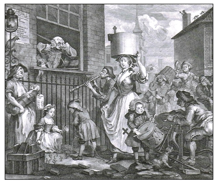
Fig. 2. Hogarth's Enraged Musicians .