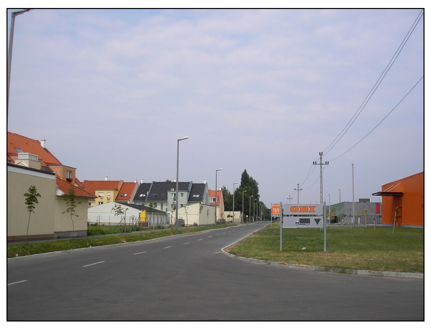
Photo 2. Vadaspark non-closed residential park (on the left) and some stores of the newly-built shopping centre (on the right)

The residential park was established in the area of a former barrack being demolished, and being built in more phase continuously since 2004. It is situated 2 km far from the city centre. Its area is around 13 ha, and its population number is app. 400-500. The majority of houses are two or three-storey-high apartment houses comprising 10 or 4 flats, but low-rise single-family (detached or semi-detached) houses can be found as well. All of them were built by property developers (companies) except the detached houses which were constructed by their owners.