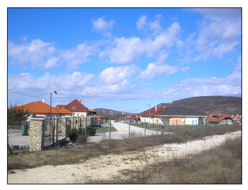
Photo 1. At the eastern border of Magdolna-völgy closed residential park

The case study area is located separately, 2 km far from the centre of the village. The area of Magdolna-völgy is app. 100 ha and it is divided into app. 365 plots that are fully serviced with communal infrastructure (water, electricity, sewage etc.). About 75 percent of the plots are already built up by residential buildings; the estimated number of population is 700. The overwhelming majority of houses are low-rise single-family (detached) houses that were built either by their owners or by property developers (companies). Near the main gate a couple of condominium houses were erected with 3 storeys, each comprising 5-6 dwellings. Magdolna-völgy is located in a valley and it is almost completely surrounded by metal fence (Photo 1). The main entrance of Magdolna-völgy is closed by a gate and an 24 hours guard service. The security control system records the number plate of each car or lorry arriving to the gate except pedestrians who can freely pass through the gate without such control (but they are also watched by the guards). The physical isolation of the estate is further strengthened by the Budapest-Esztergom railway line on the north-east, and the Budapest-Esztergom main road on the south-west.