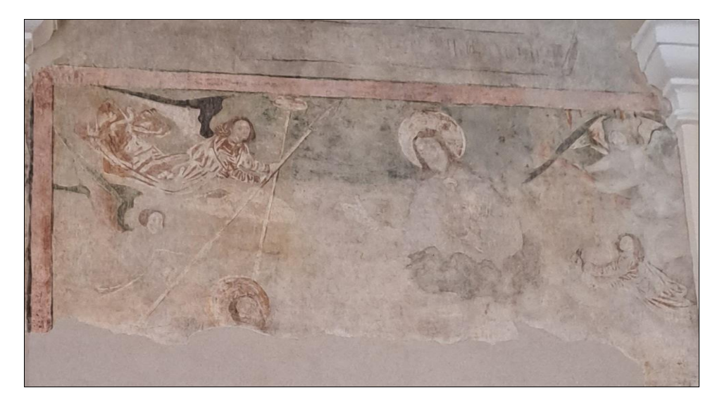
Fig. 3 Christ as intercessor - Wall painting in the (former) Dominican church of Mary Magdalene in Sibiu