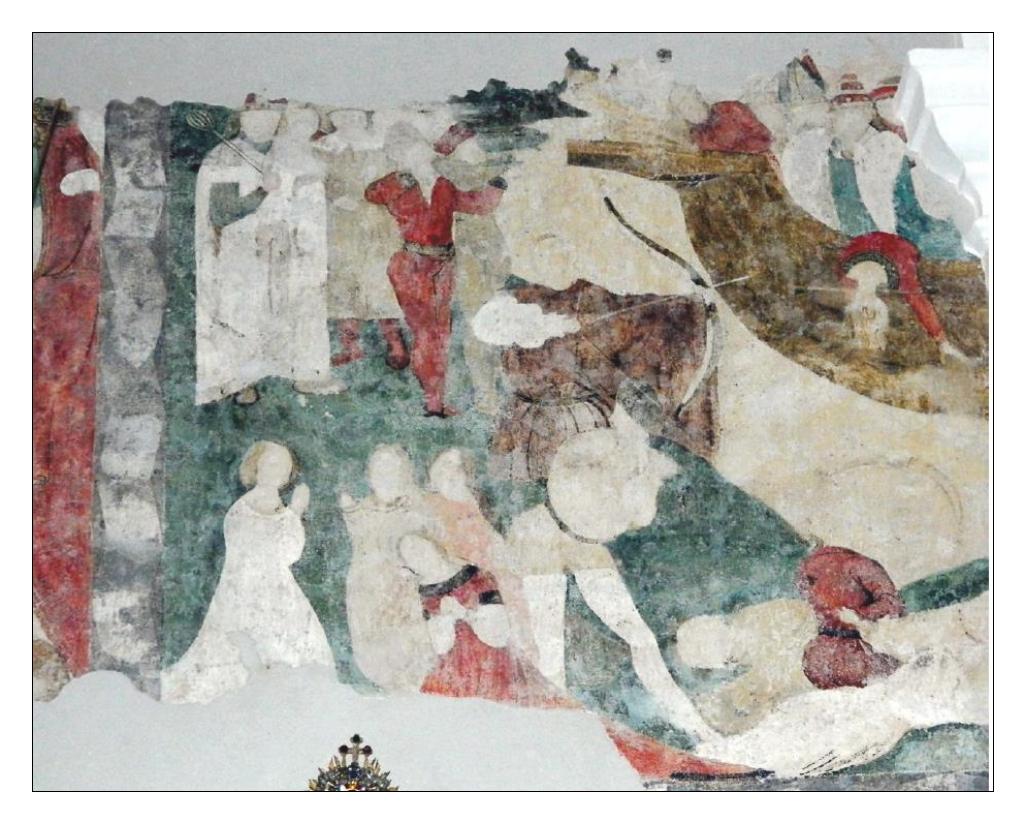
Fig. 5 The Martyrdom of St. Ursula and the Eleven Thousand Virgins - Wall painting in the (former) Dominican church of Mary Magdalene in Sibiu